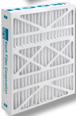
Series HW MERV 8 Replacement for Honeywell®

All models of Multi-Pleat AB, HW and SG are available in MERV 8, MERV 11 and MERV 13 efficiencies. MERV 11 shown at right.