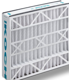
Series AB MERV 8 Replacement for Airbear®