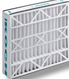
Series SG MERV 8 Replacement for Space-Gard®